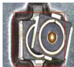
Packing Fail (Double packing)