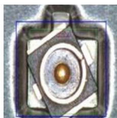
Packing Fail (Wrong position)